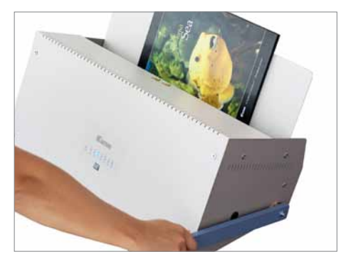
Easy to use.