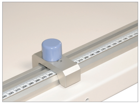
Measurement scale for fast and easy positioning.