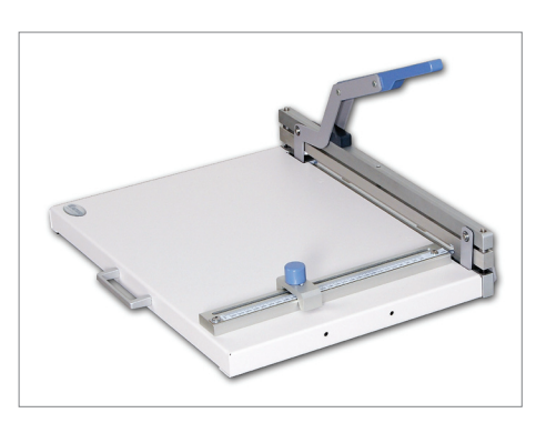
Light and compact tabletop unit.

Product information as of February 2009 and is subject to change without notice.